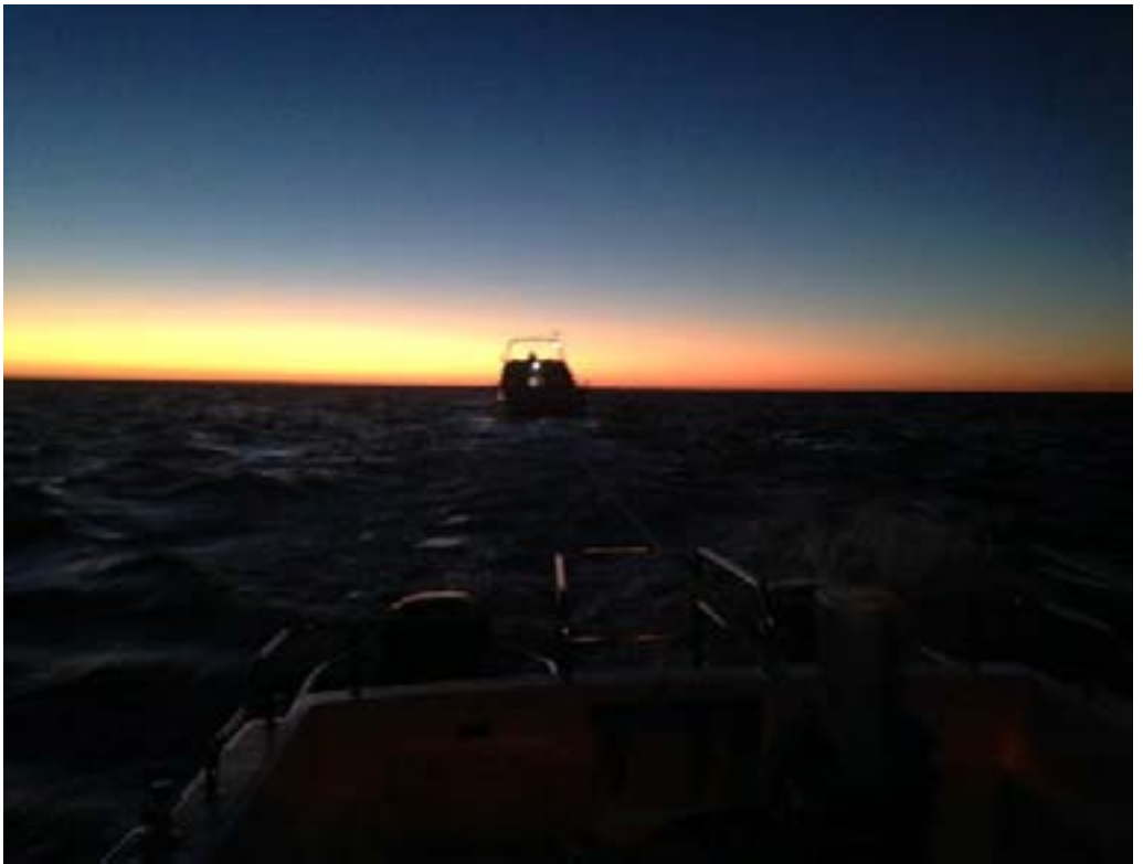
MV B'lieve under tow by Hyne Timber Rescue as the dawn breaks on Monday 9th July 2018. Below is the view from B'lieve approaching Bundaberg.